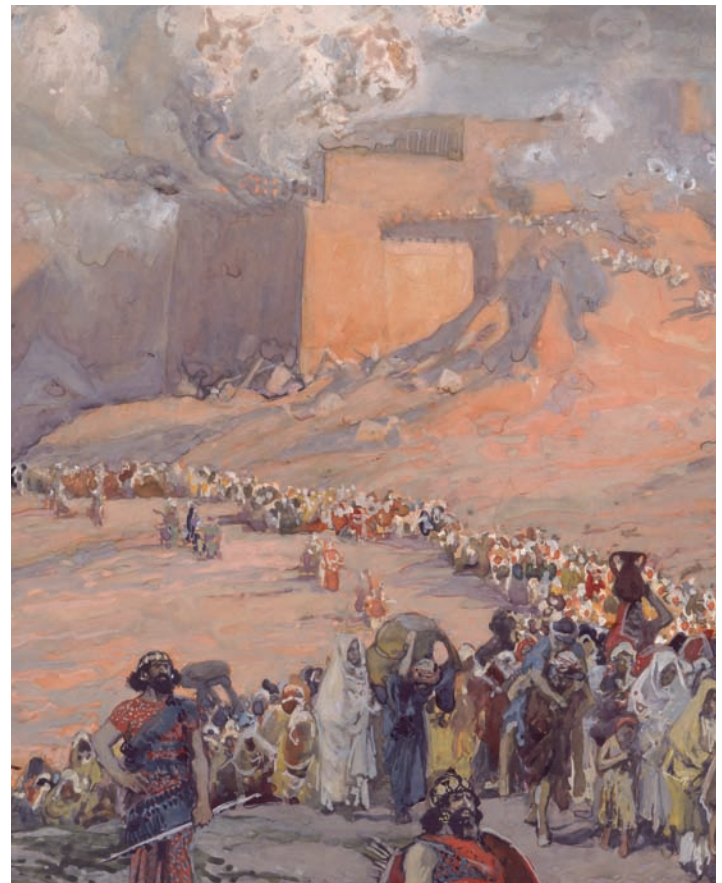
The Flight of the Prisoners —Tissot